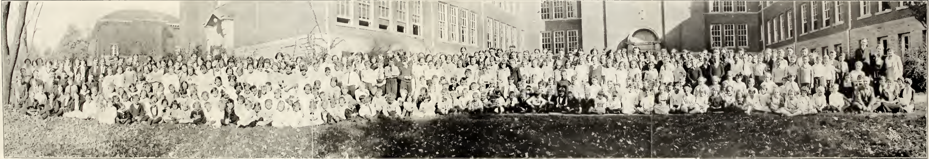
THE WILLIAM MCGUFFEY SCHOOL